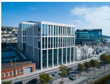
Ibec Cork Office, Penrose Dock, Cork