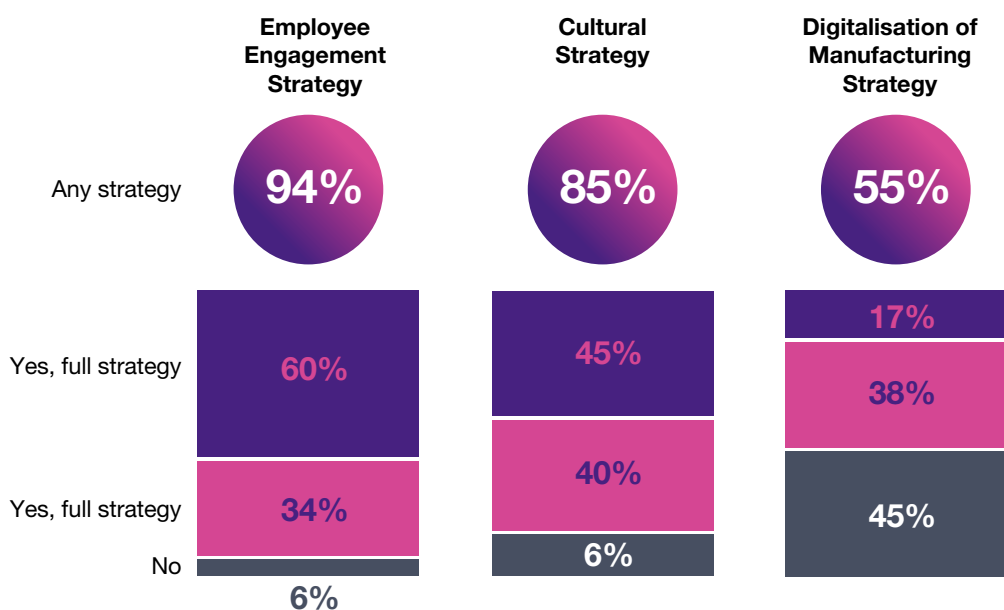
Figure 3: Does your company have a 'Employee Engagement Strategy', a 'Cultural Strategy', a 'Digitalisation Strategy'? Responses from a survey conducted by Ibec Medtech & Engineering Sector Group in 2019

For example, Ireland has the second lowest density of industrial robots in the EU15, despite the recorded benefits of robots being strongly linked with increased productivity. Figure 3, from our 2019 survey, shows that just over 9 in 10 (94%) member companies claim they have some level of employee engagement strategy, although a third claim this is just a partial strategy. Just over half (55%) of member companies claim to have a digitalisation of manufacturing strategy, although less than 1 in 5 (17%) claim to have a full strategy.